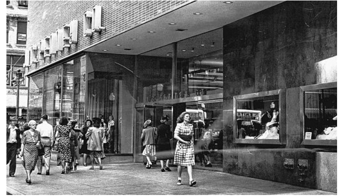
Pedestrians in May 1948 pass the Race Street display windows of Downtown's J.C. Penney store. The Terrace complex included two department stores.