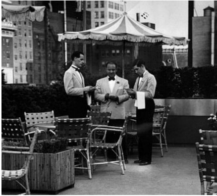
The Terrace Garden restaurant was just off the eighth-floor lobby of the Terrace Plaza in 1949.