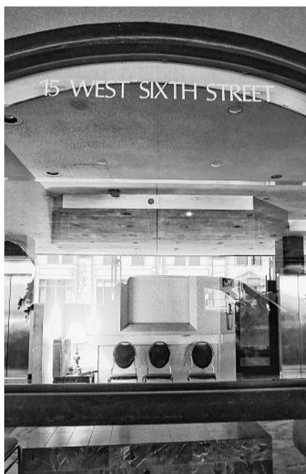
The Sixth Street entrance to the former Terrace Hotel, Downtown, which closed in 2008.