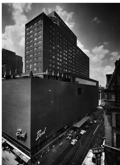
In 1947, the new Downtown complex including a hotel, department stores and restaurants was a state-of-the-art development.

New Yorker who acquired historic Terrace Plaza complex in June plans to renovate the hotel and the commercial space below, but some earlier projects have troubled track records.