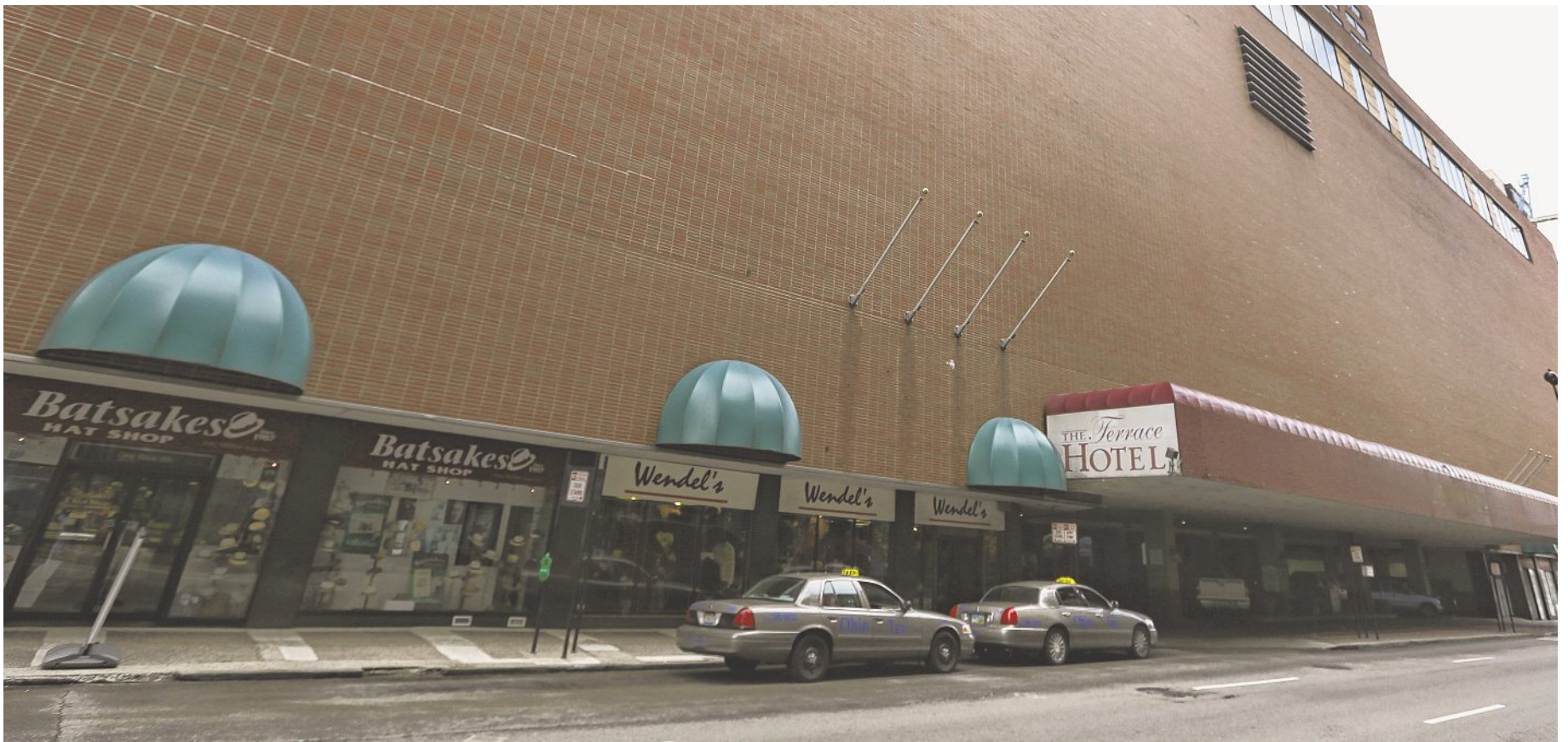
Retailers remain along the eastern half of the Terrace Plaza's street level. The Terrace Hotel closed in 2008, but a developer hopes to reopen it.

He said that he's talked to several hotel chains, or "flags," and wasn't sure yet which flag the hotel would be. He predicted that the portion of the building that previously was retail space – at one time serving as home to J.C. Penney's and Bond's department stores – would remain retail. He